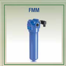
High Pressure Filters

MP Filtri has always forged close partnerships with customers thanks to its commitment to meeting their needs and delivering effective solutions. The company offers a wide range of high-performance products including: