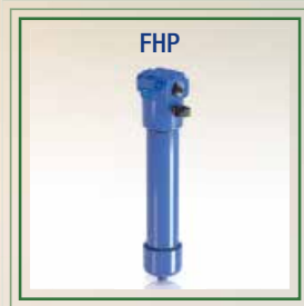
High Pressure Filters