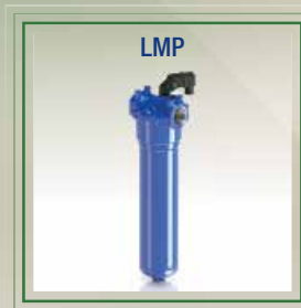
Low Pressure Filters